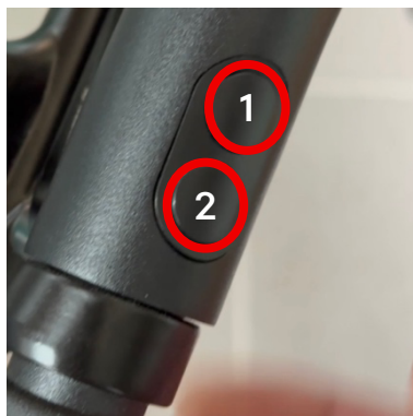
Turn on and press bell